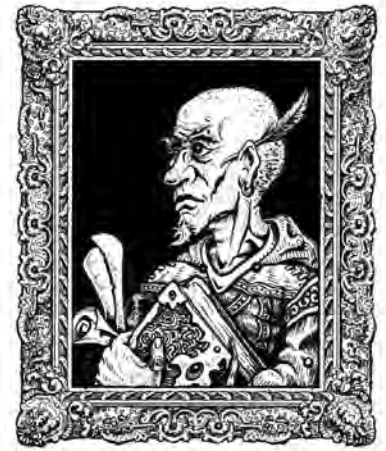
Table 1-8: Eight Underlings of the Rainbow Palace & The Citadel